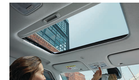
Power tilt-and-slide sunroof