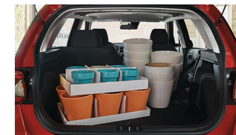
Versatile cargo area