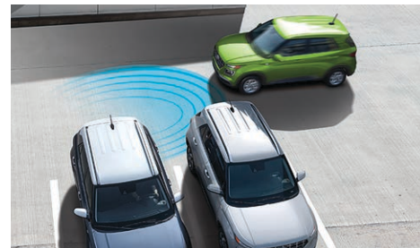
Rear Cross-Traffic Collision Warning