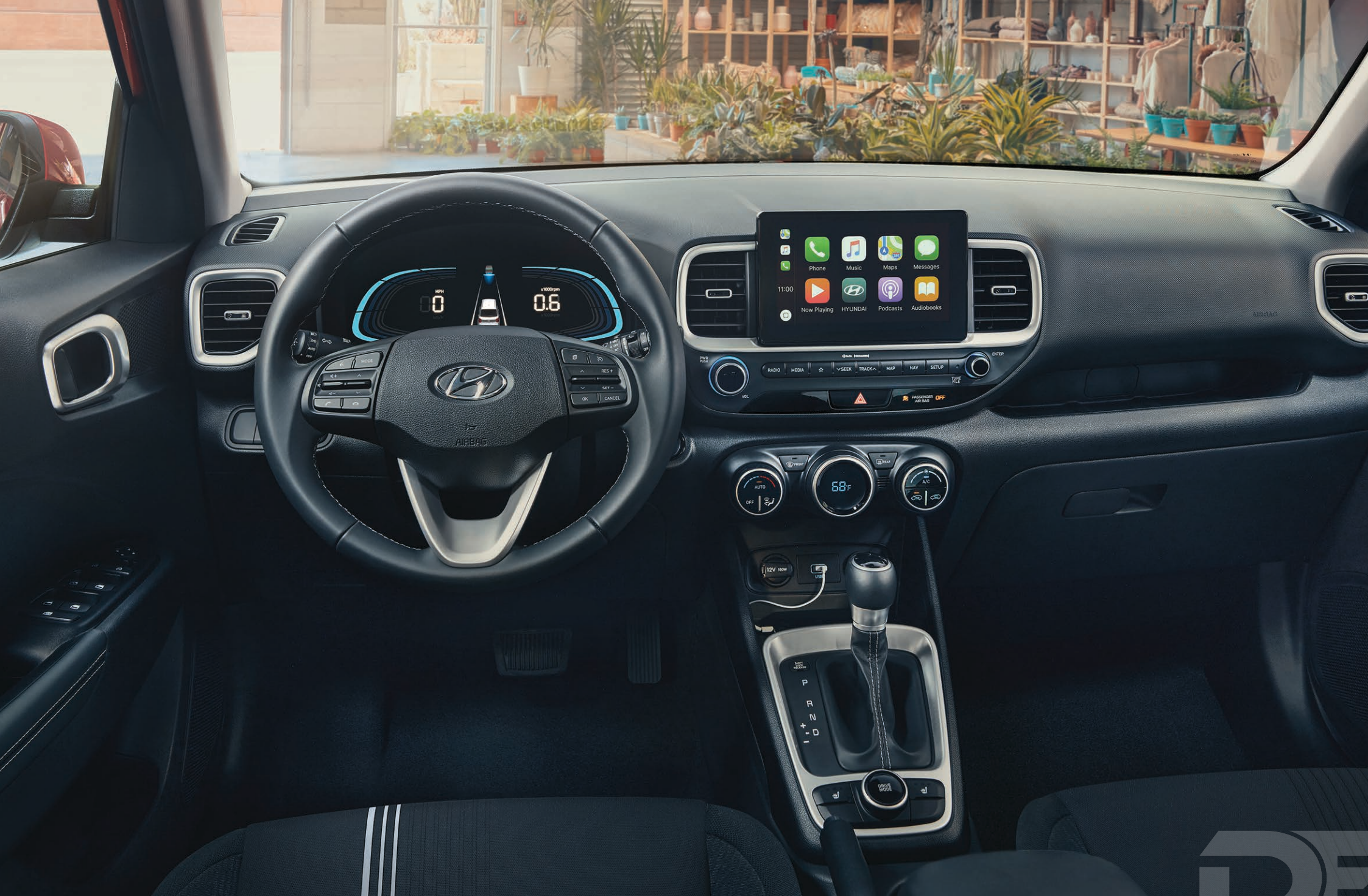
VENUE Limited in Black Cloth/Leatherette