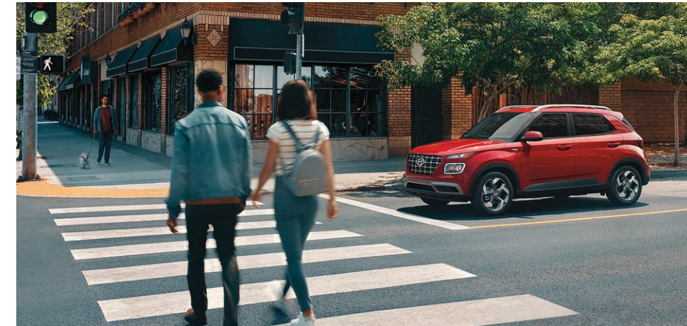
Forward Collision-Avoidance Assist with Pedestrian Detection

Venue's safety engineering goes all the way to its core with a body constructed of advanced high-strength steel. And zones designed to absorb and disperse impacts, helping to protect you and your passengers inside the cabin.