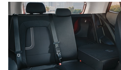
60/40 split-folding rear seats