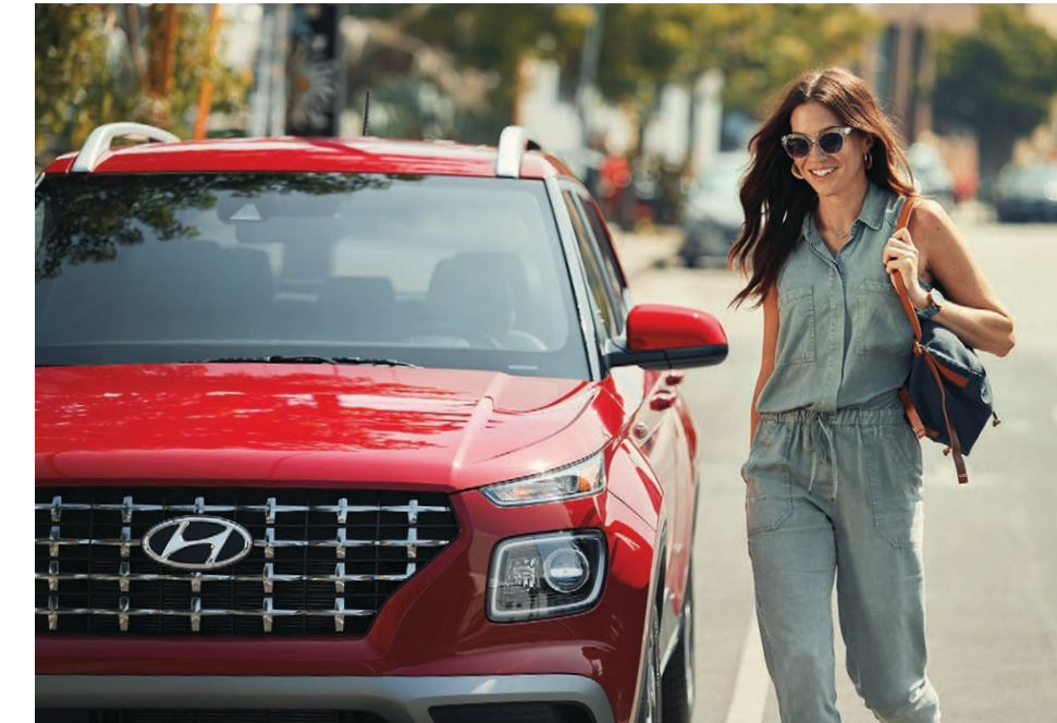
Proximity Key with push button start